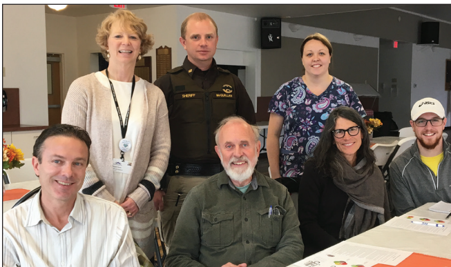
The CART advisory committee is committed to serving the rider, meeting weekly at various locations around the county. Advisory committee members representatives from all facets around the county. From city and county government, to local healthcare provider representation. Meetings are open to the public.