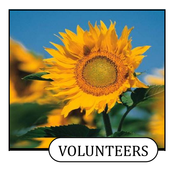
Thank You! We hold each of you in the highest regard!