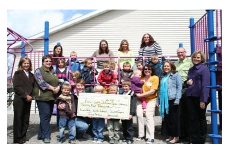
Beartooth Children's Center $12,000.00