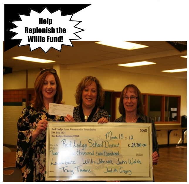
Red Lodge School District $29,200.00 Luther School District $640.00 Roberts School District $5,447.00