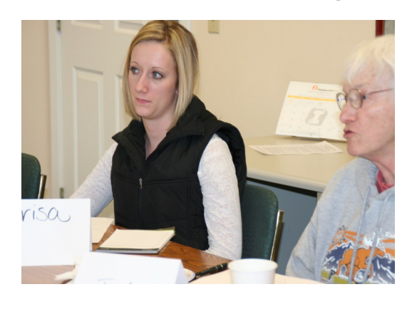
Project Management MSU-B Series