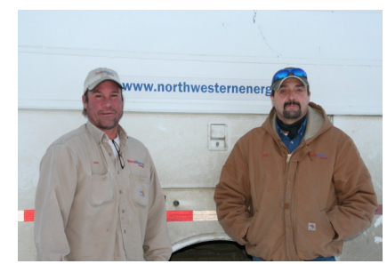
Northwestern Energy Giving Back