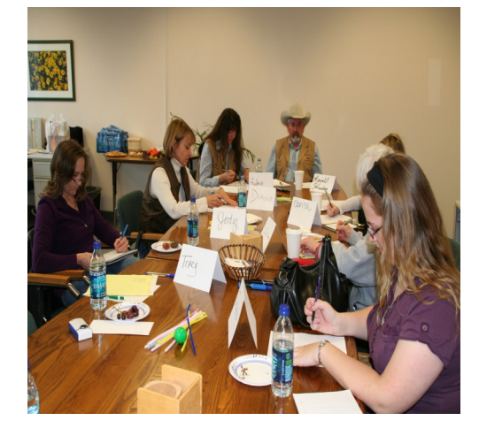
Nonprofit Leadership MSU-B Series