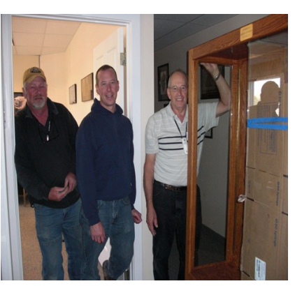
Hospital donation of oak cabinet